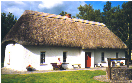
The Rice family home, Callan,